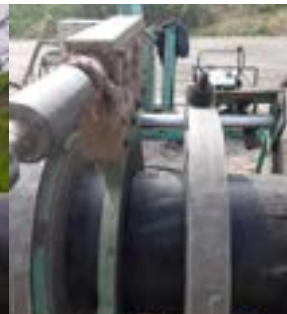
Heating process for bid forming