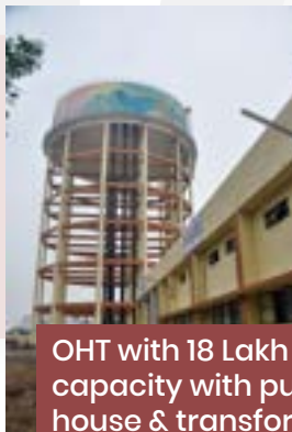
OHT with 18 Lakh lit. capacity with pump house & transformer room