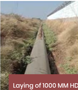
Laying of 1000 MM HDPE