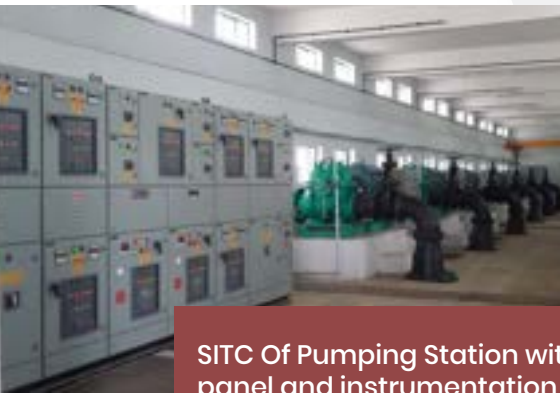
SITC Of Pumping Station with panel and instrumentation