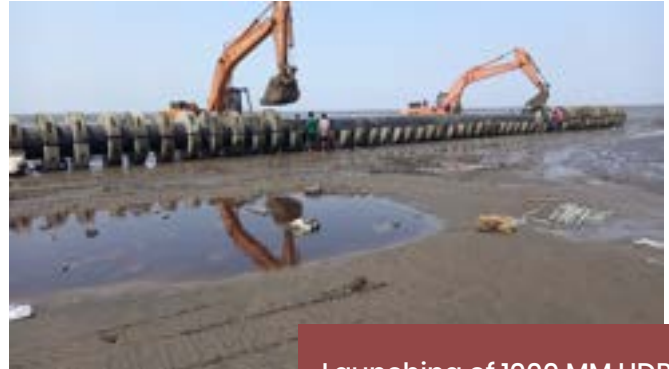
Launching of 1000 MM HDPE