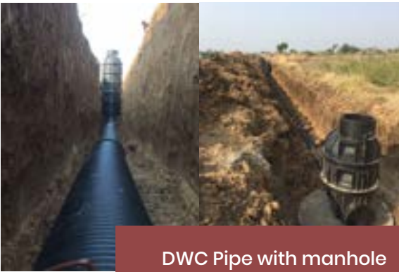
DWC Pipe with manhole