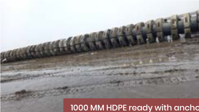
1000 MM HDPE ready with anchor blocks for offshore work