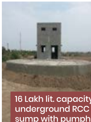
16 Lakh lit. capacity underground RCC sump with pumphouse