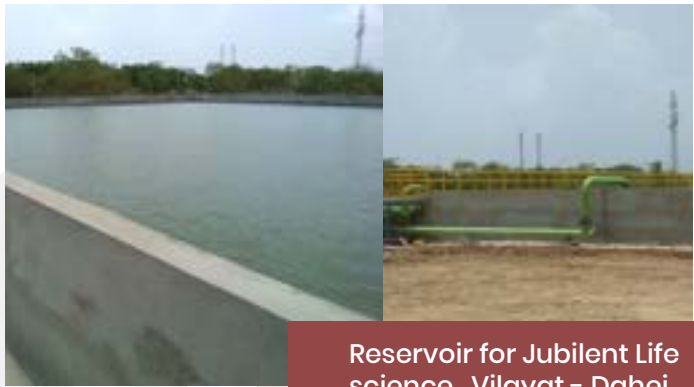
Reservoir for Jubilant Life science, Vilayat - Dahej