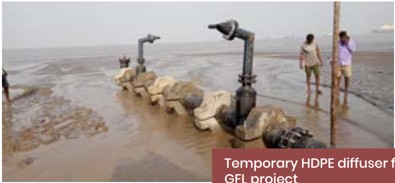
Temporary HDPE diffuser for GFL project