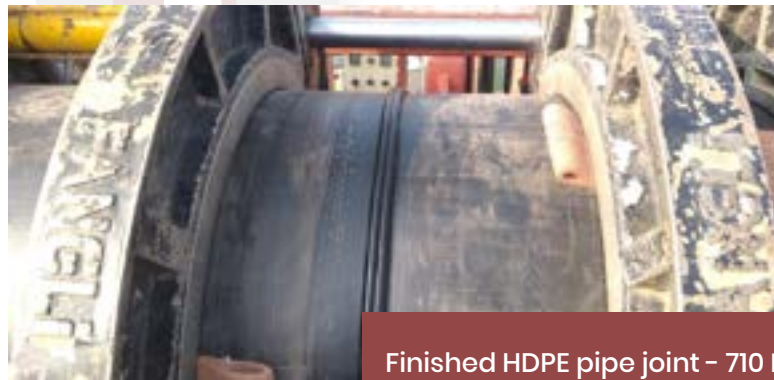
Finished HDPE pipe joint - 710 MM