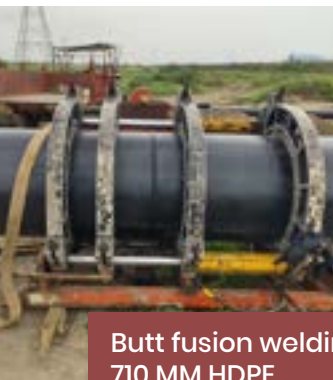
Butt fusion welding 710 MM HDPE